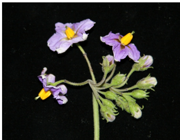
Huckleberry Gold has a violet flower and limited pollen production.